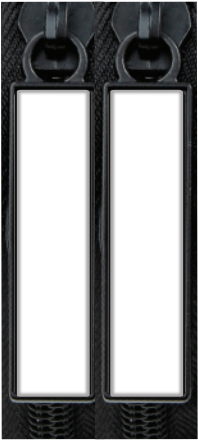
Left Zipper Pull Right Zipper Pull