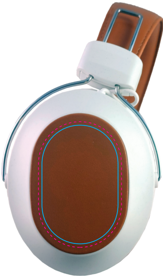
Headphones Right Side