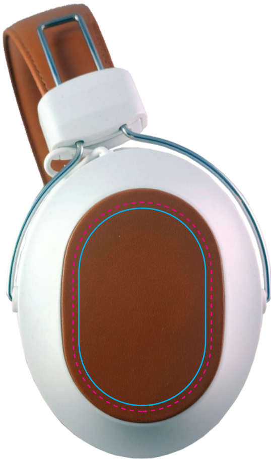
Headphones Left Side