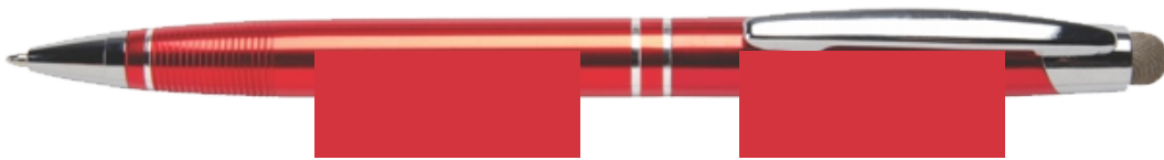
Flag Red w/Black Ink

Barrel Revolution = 1 ¼ x ½" Cap Revolution = 1 ¼ x ½"