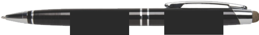
Black w/Black Ink

Barrel Revolution = 1 ¼ x ½" Cap Revolution = 1 ¼ x ½"