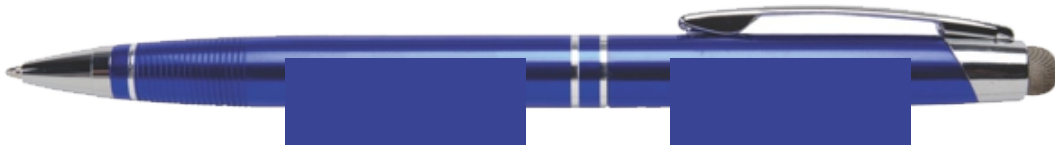
Blue w/Black Ink

Barrel Revolution = 1 ¼ x ½" Cap Revolution = 1 ¼ x ½"