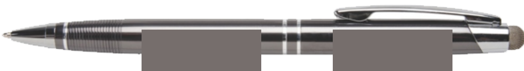
Gunmetal w/ Black Ink

Barrel Revolution = 1 ¼ x ½" Cap Revolution = 1 ¼ x ½"