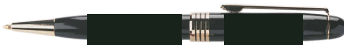
Blue w/Black Ink

Barrel Revolution = 1 ¼ x ½" Cap Revolution = 1 ¼ x ½"