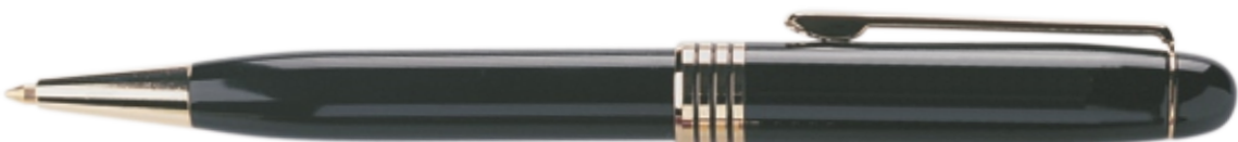
Black w/Black Ink