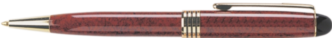
Marble Burgundy w/Black Ink