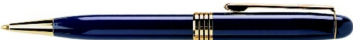
Blue w/Black Ink