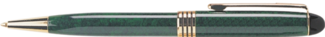
Marble Green w/Black Ink