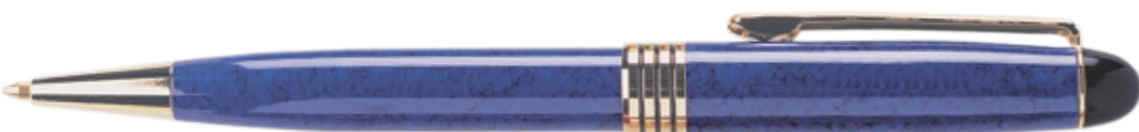
Marble Blue w/Black Ink