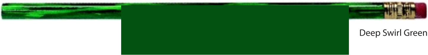
Deep Swirl Green