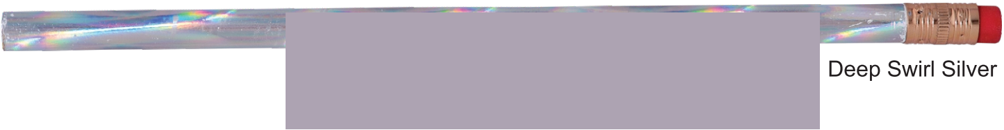
Deep Swirl Silver