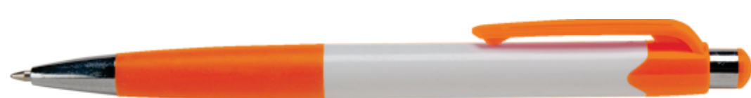
Orange w/Black Ink