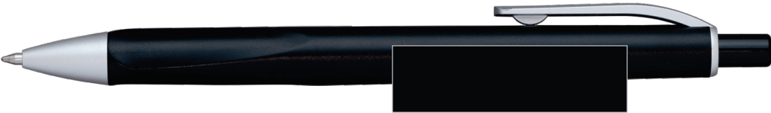
Black with Black ink