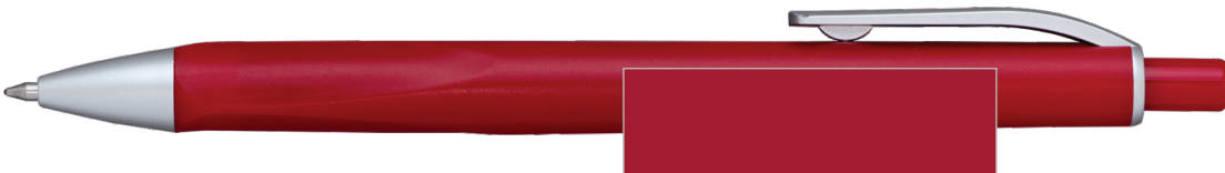
Red with Black ink