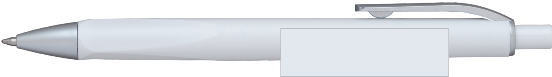
White with Black ink