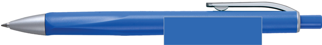
Blue with Black ink