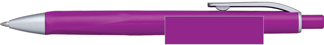
Purple with Black ink