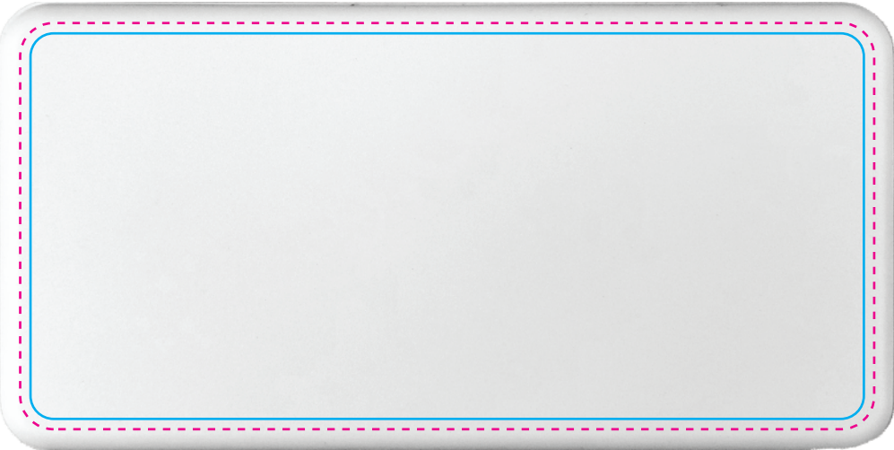
Power Play 10k Top of Product