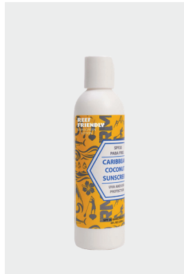
4 oz Happy Reef Sunscreen HRS4