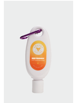
2 oz Happy Sunscreen Tottle Bottle HRST2