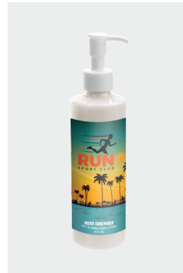
8 oz Happy Reef Sunscreen HRS8