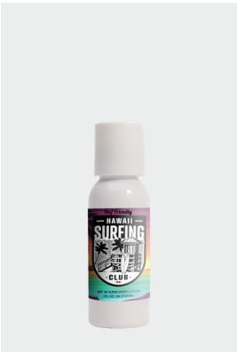
1 oz Happy Reef Sunscreen HRS1