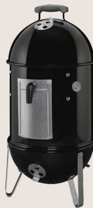
Weber Smokey Mountain Cooker™ 14" Smoker

Wake up and light the smoker, because succulent pulled pork and fall-off-the-bone ribs come to those who wait. The Smokey Mountain Cooker smoker has two cooking grates for smoking multiple items at once, and dampers that adjust easily so that you're always in control of the heat—and your feast.