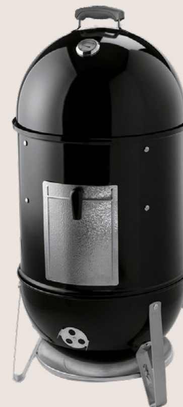
Weber Smokey Mountain Cooker™ 22" Smoker