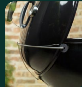
Tuck-Away Lid Holder