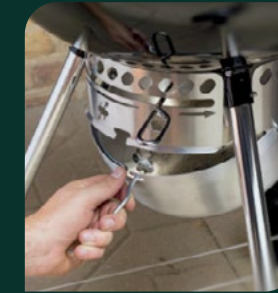
One-Touch Cleaning System