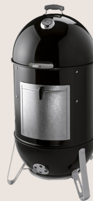
Weber Smokey Mountain Cooker™ 18" Smoker