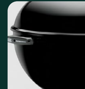
Superior Heat Retention